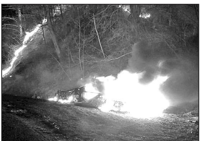
Cars on the roadside are said to be the cause of recent wildfires in Lumpkin and Union counties. This is one of the cars on U.S. 129 in Lumpkin County.